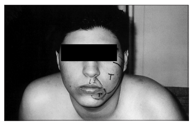
Figure 2. Points on the face of a patient that elicit precisely localized, modality-specific referral in the phantom limb 4 weeks after amputation of the left arm below the elbow. Sensations were felt simultaneously on the face and phantom limb.

Taken collectively, these findings provide strong support for the remapping hypothesis. They may allow us to track the time course of perceptual changes in humans and relate these in a systematic way to anatomy. The occurrence of topography and modality specificity rules out any possibility of the referral being due to nonspecific arousal.