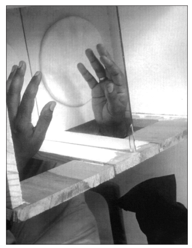
Figure 3. Mirror box used to provide visual feedback. Patient views the reflection of his own hand in the mirror.

Is the remapping that occurs in the adult somatosensory cortex beneficial to the organism? Or is it an "epi-